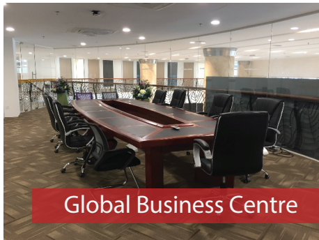
Global Business Centre